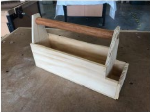
Year 9 Industrial Technology Timber