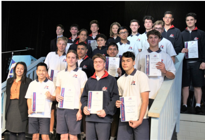
Year 10 Recipients of the BEWA Award for term 2.