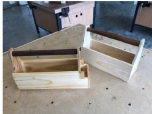
Year 10 Industrial Technology Timber