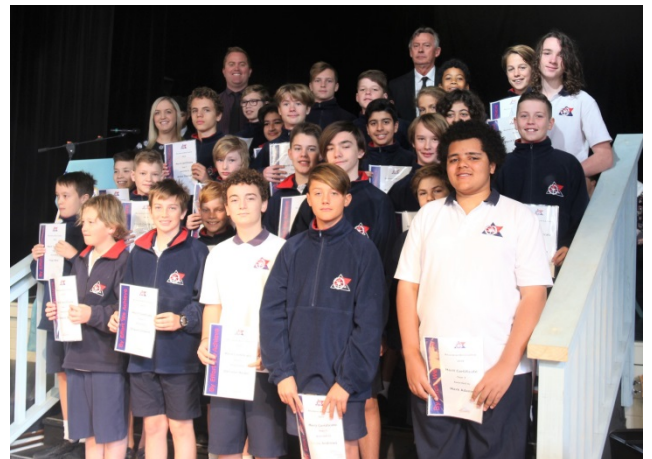
Year 7 Recipients of the BEWA Award for term 2

This assembly was even more important as we also announced for the first time our Prefects 2019 / 2020 and they were presented with their badges and ties in front of our school community.