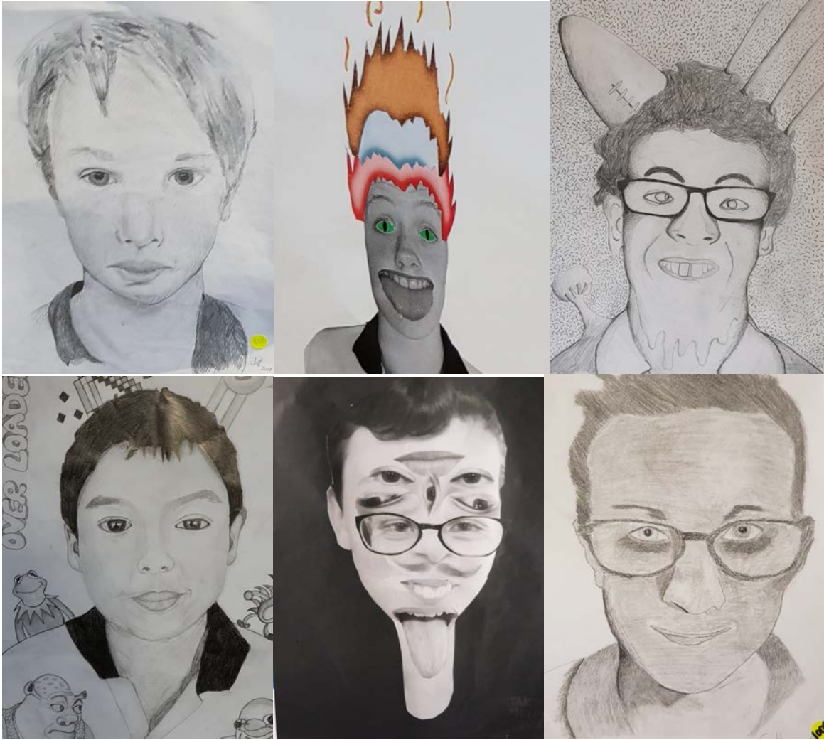
Some of the amazing Year 7 works displayed as part of the Ballybald exhibition