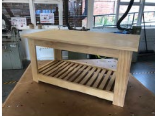
Year 8 - Beach Chairs - Industrial Technology Timber