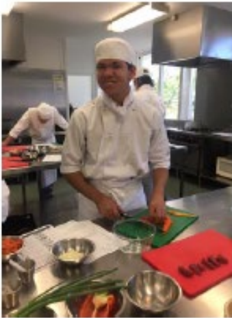
Year 11 Hospitality