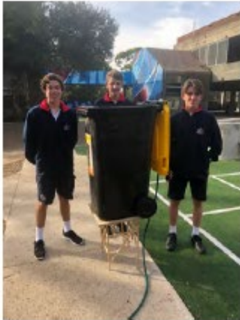
Year 9 Engineering - Investigating and testing Engineering Structures