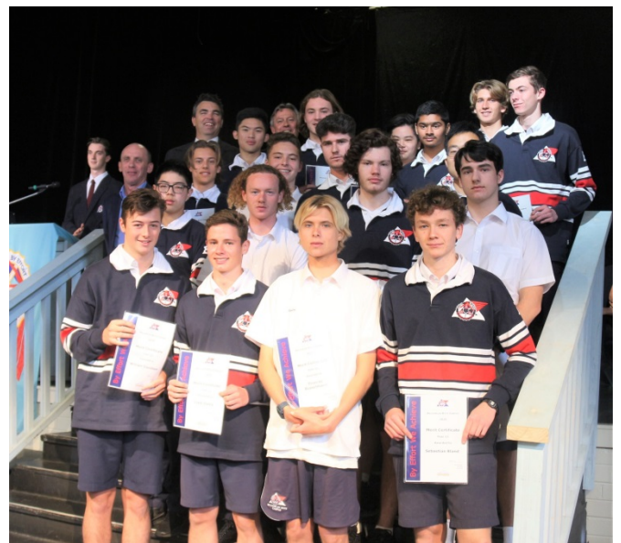
Year 11 Recipients of the BEWA Award for term 2.