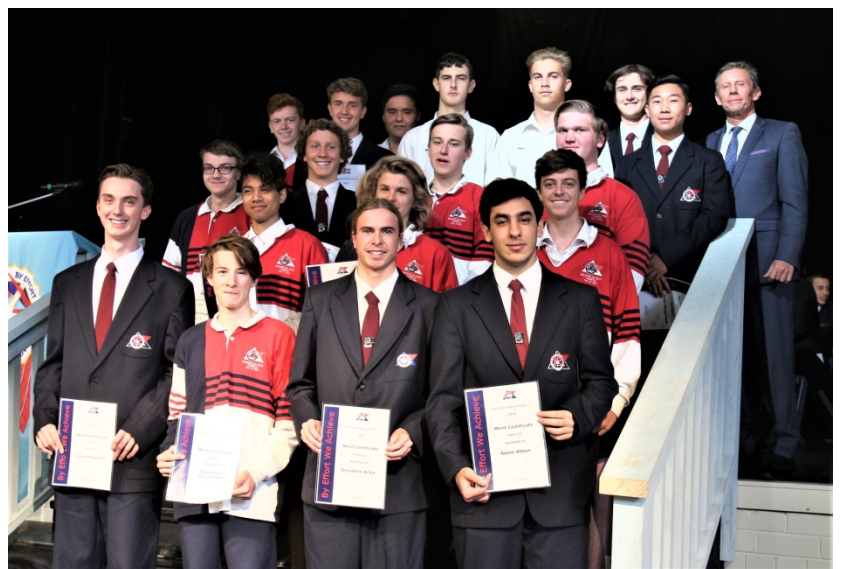
Year 12 Recipients of the BEWA Award for term 2.