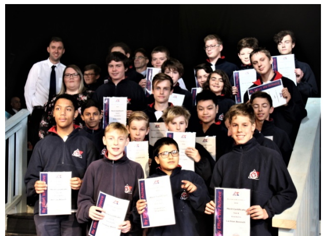
The Year 8 Recipients of the BEWA Award for term 2.