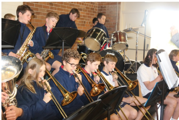
As always, our Music students entertain the assembly. The Year 7 Concert Band.