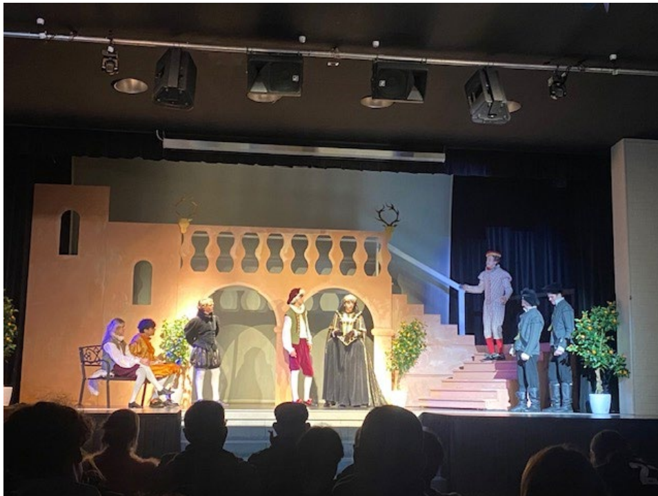
Amazing set design for the Twelfth Night Production

Our P & C has again been busy donating through its "Shark Tank" with a request of $54,460 to purchase 20 new multimedia computers boasting impressive specifications that are industry competitive. Mr Miller is ecstatic with the specs of these computers,