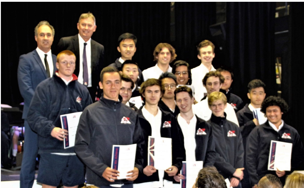
Year 11 Recipients of the BEWA Award for term 2.