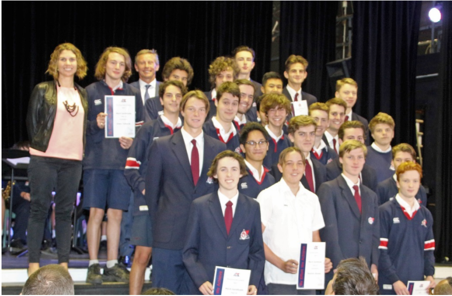
Year 12 Recipients of the BEWA Award for term 2.