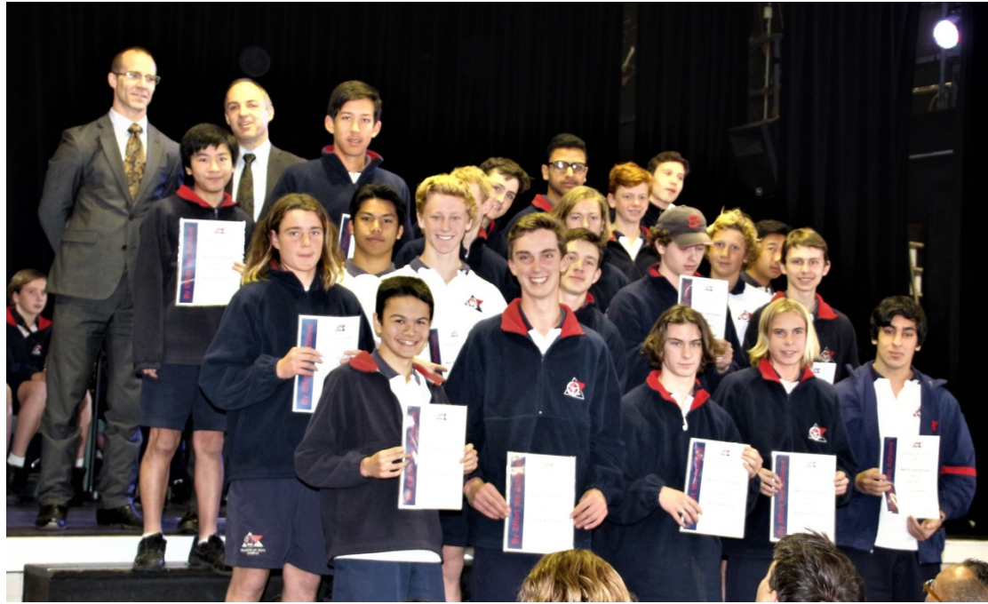
Year 10 Recipients of the BEWA Award for term 2.