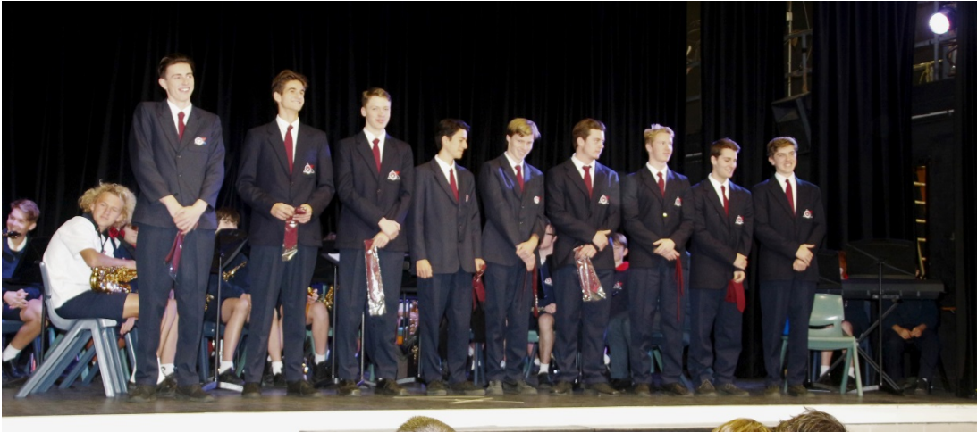
Prefects 2107 on stage to present the newly inducted Prefects 2018 with badges and ties.