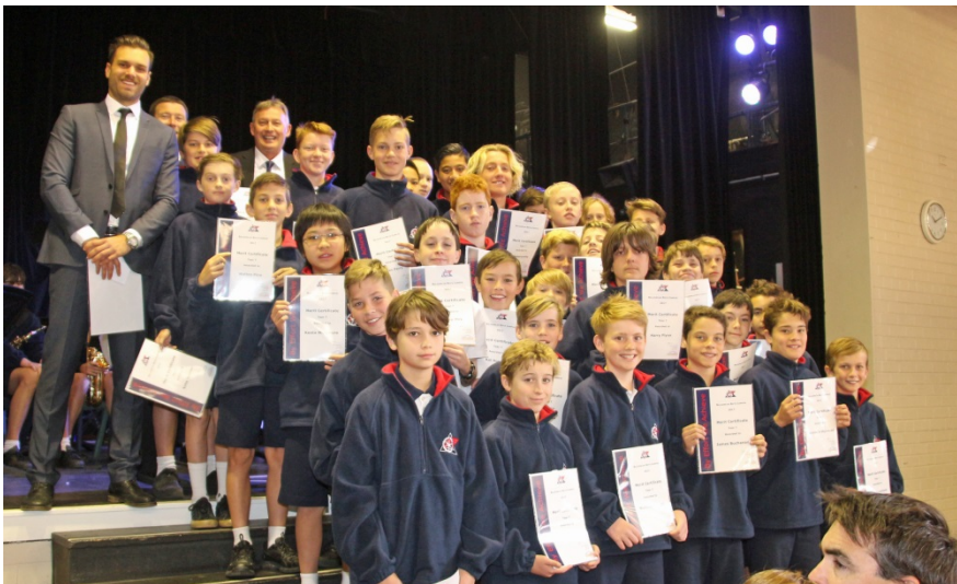
Year 7 Recipients of the BEWA Award for term 2.

This assembly is even more important as we also announce for the first time our Prefects 2016 / 2017 and they are presented with their badges and ties in front of our school community