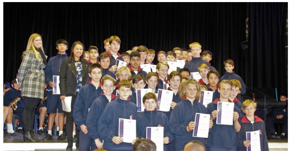
Year 8 Recipients of the BEWA Award for term 2.