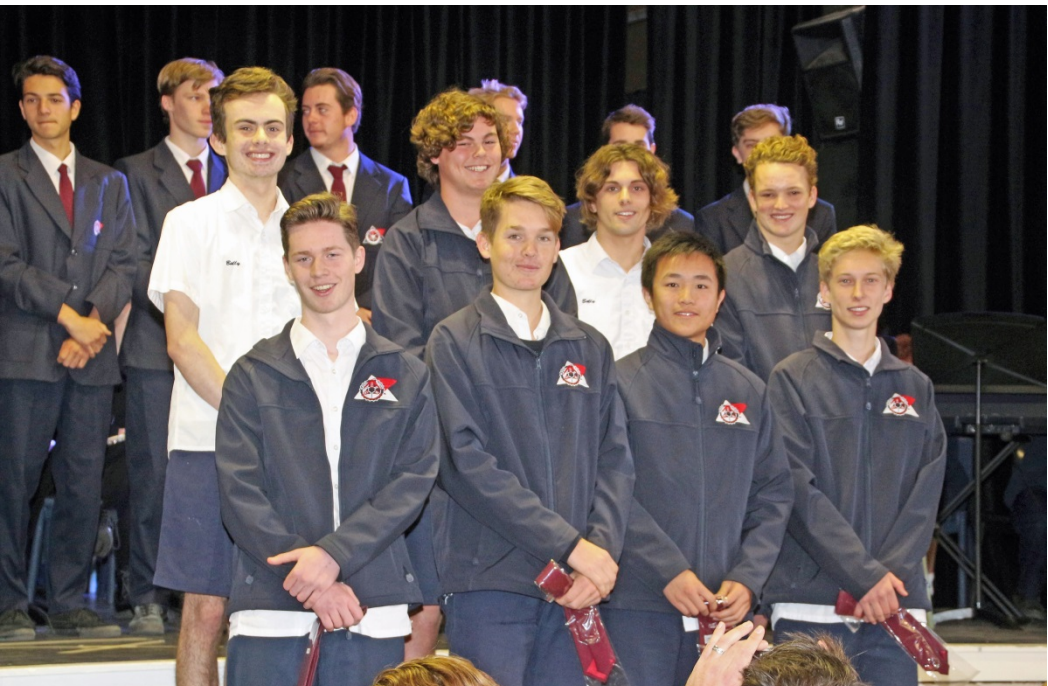
Newly inducted Prefects 2018