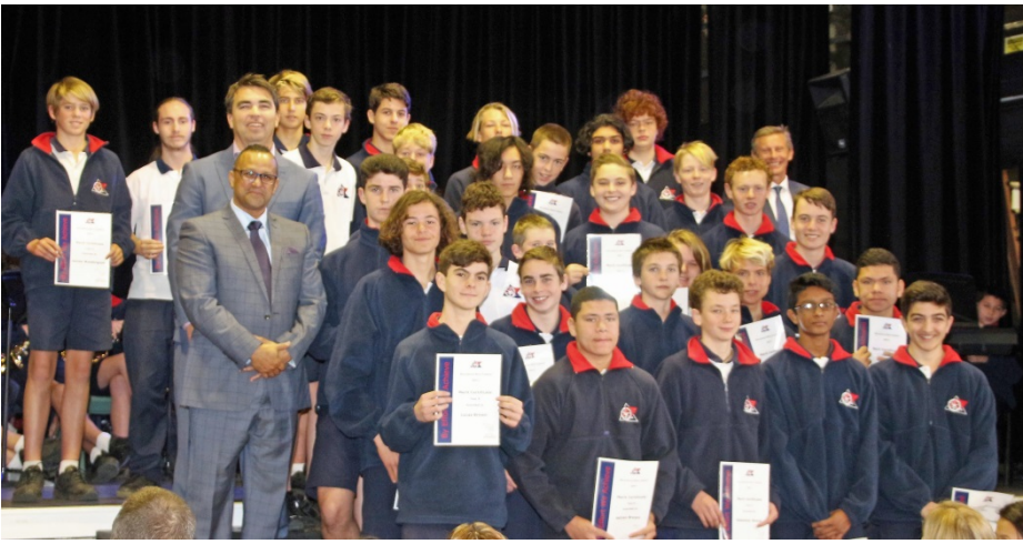
Year 9 Recipients of the BEWA Award for term 2.